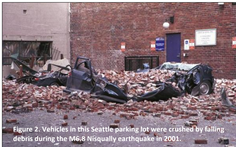
Figure 2. Vehicles in this Seattle parking lot were crushed by falling debris during the M6.8 Nisqually earthquake in 2001.

LEARN MORE ABOUT WHAT YOU CAN DO: www.emd.wa.gov